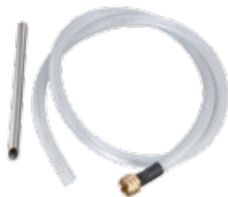
Standard 9' pickup hose and 15" stainless steel tube