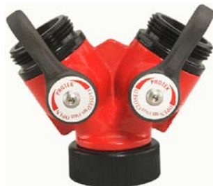
Style 505, 506 Forestry Wyes